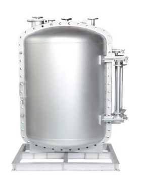
Gas Valve Unit

VOLCANO Co.,Ltd. *1 developed an "Oil/Gas Combination burner for LNG Fueled vessel" and has launched "Vignis-mini" as new product on 12<sup>st</sup> APR, 2016.